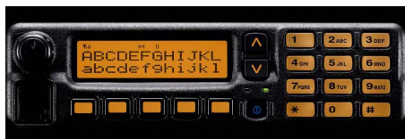
Two line setting display example

The IC-F1710/F1810 series has a large dot matrix display to show information with high resolution characters. The dot matrix font allows upper and lower case characters to be easily distinguished. The display setting is programmable to show one line and 12 characters, or two lines and 24 characters.