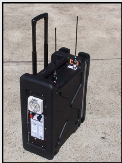
Mastercom Portable Conventional System