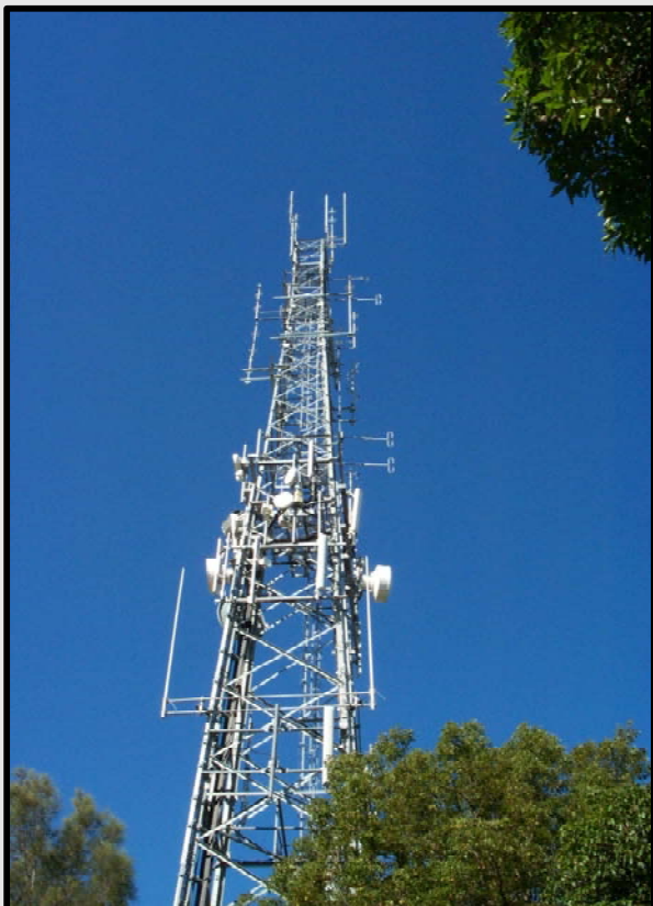
Pennant Hills Radio Site

Our engineering and technical departments offer system support that includes planning, implementation, maintenance and system improvements. A great amount of work goes on 'behind the scenes' to protect the quality and integrity of our systems. Our support team understands just how important our systems are to our clients livelihood – that's why we offer a 24 hour, 7 day a week support.