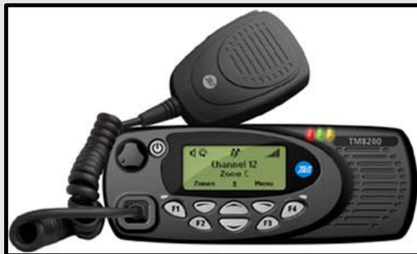
Tait TM8000 Conventional Mobile Radio