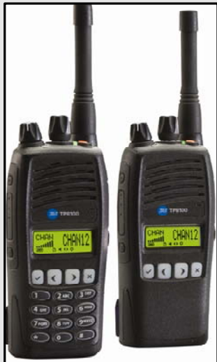
Tait TP8000 Series Conventional Portable Radio