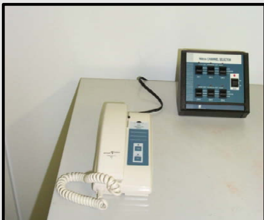
Non Critical Control Point