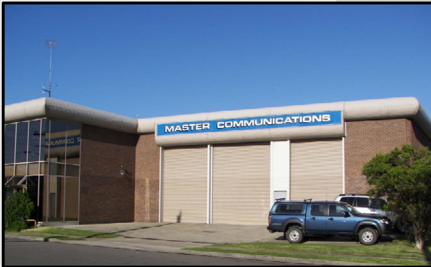
Mastercom's Granville Office

Systems are available that provide control and monitoring of multiple radios by multiple operators. All systems are modular and support expansion; however, each provides a different level of functionality.