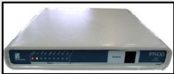
Radio over IP Link